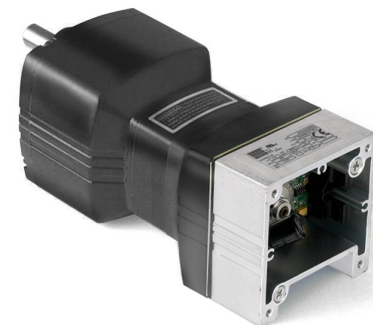
Stock / standard 22B/SR-D INTEGRA gearmotor ( click here for more info )