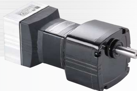
Bodine type 22B/SR-D INTEGRAMotor

Foam-in-bag molding systems create molded cushions for products that require a consistent, precise fit and product protection during the shipping and handling process. The machine shown is driven by a Bodine INTEGRAMotor brushless DC (EC) gearmotor with built-in control.