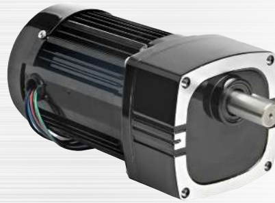
Bodine type 42R-FX

Case sealers are packaging machines that drive an open card board box between two vertical conveyors while tape is wrapped around the box to close it. The model shown uses two Bodine type 42R-FX (AC) parallel shaft gearmotors to drive the conveyors.