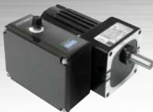
Type 34B/SR-WX (IP-44)