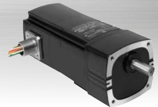
Type 34R-FX AC and Type 34B-FX BLDC (IP-66)