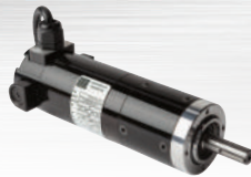
24A-60P (IP-66 with flange seal kit)