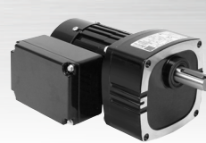
Type 34R-FX AC (IP-44)